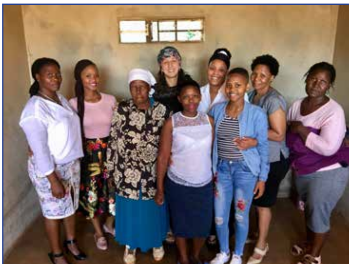
BELOVED WOMEN OF LEHAE

NONPROFIT ORGANIZATION U.S. POSTAGE PAID PERMIT NO. 9057