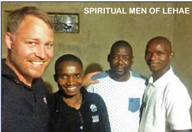
SPIRITUAL MEN OF LEHAE